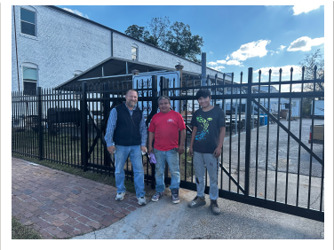
OUR NEW FENCE