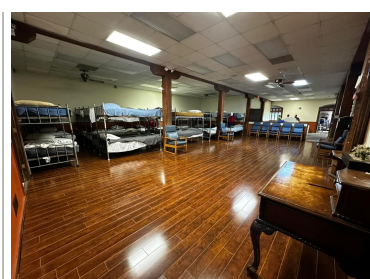
OUR BEAUTIFUL NEW DORM FLOOR